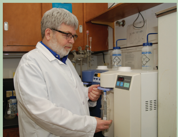
Laboratory staff continually monitor drinking water. Water quality data is posted monthly on the MCWD website ( www.mcwd.org ).

Centers for Disease Control: cdc.gov Fort Ord Cleanup Project: fortordcleanup.com