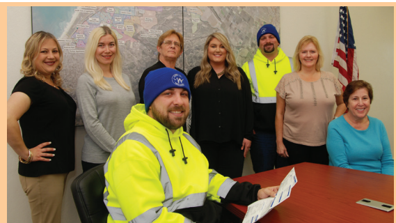
The District's Customer Service staff is available to assist you Monday through Friday, 8 AM to 5:30 PM.